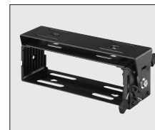
MB-17A MOBILE MOUNTING BRACKET