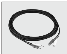
OPC-441 SPEAKER EXTENSION CABLE 5.0m (16.4ft)