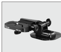
MB-65 MOUNT BASE Mounts the remote control head with the MB-58. Angle and direction is adjustable.