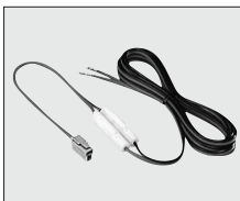
OPC-1132, OPC-347 DC POWER CABLES OPC-1132: 3.0m (9.8ft); OPC-347: 7.0m (23ft)