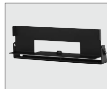
MB-58 REMOTE CONTROL HEAD BRACKET Mounts the remote control head in a convenient location.