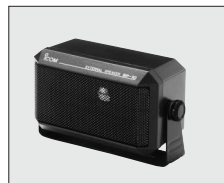
SP-10 EXTERNAL SPEAKER