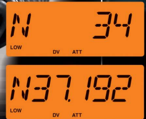
Position display example showing N 34° 37' 192".