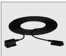
OPC-600/R, OPC-601/R SEPARATION CABLES OPC-600/R: 3.5m (11.5ft); OPC-601/R: 7.0m (23.0ft)