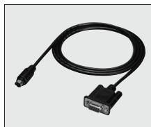
OPC-1384 DATA CABLE Transceiver to PC/GPS receiver, 8-Pin DIN to RS-232C cable.