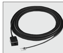
OPC-440, OPC-647 MIC EXTENSION CABLES OPC-440: 5.0m (16.4ft); OPC-647: 2.5m (8.2ft)