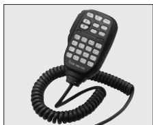
HM-133 REMOTE CONTROL MICROPHONE Remote control microphone with keypad backlighting.